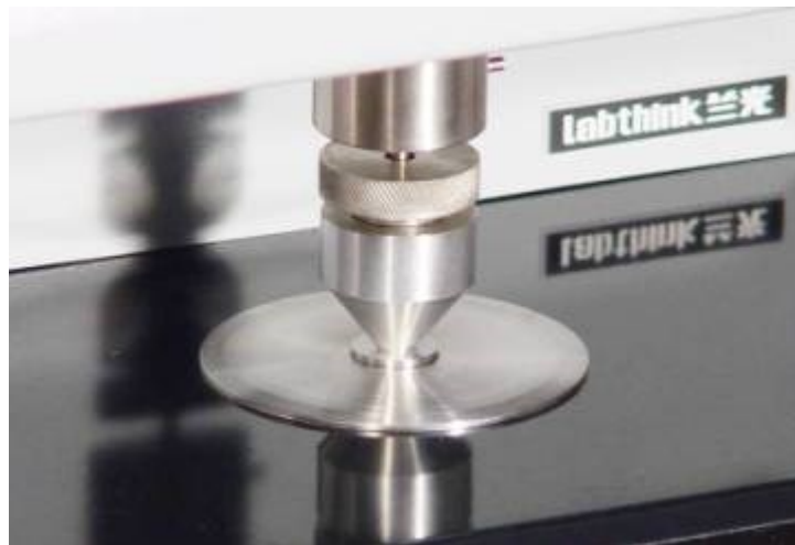
Fig .2 CHY-C1presser foot and anvil

An automatic leveling structure is adopted in Labthink CHY-C1 to make presser foot parallel to the anvil surface. Once the calibration is finished, no interference is needed from the user. In addition, the two surfaces should keep from contamination and the presser foot should avoid being touched. Disassemble the instrument without permission will disable the precision of instrument.