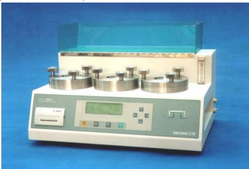
Fig.2. TOY-C1 Specimen Clamping of Film Oxygen Permeability Testing

Film specimen sampling and clamping is similar to that of the equal pressure method which is simple and convenient. To facilitate specimen sampling, TOY-C1 is furnished with special film specimen cutter. Fig. 2 shows the status that specimens have been clamped.