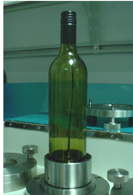
Figure 1. Finished Bottle Body Specimen for Water vapor permeability Testing